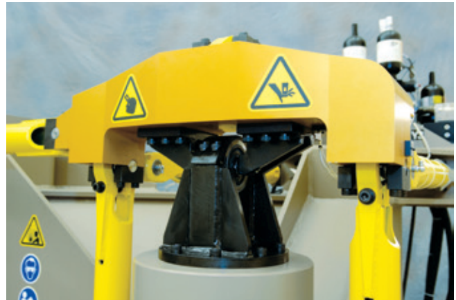
A low-friction actuation scheme ensures utmost control and data integrity.