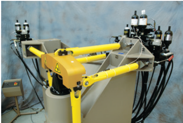
An easy-access mounting assembly lets you quickly install and remove specimens.