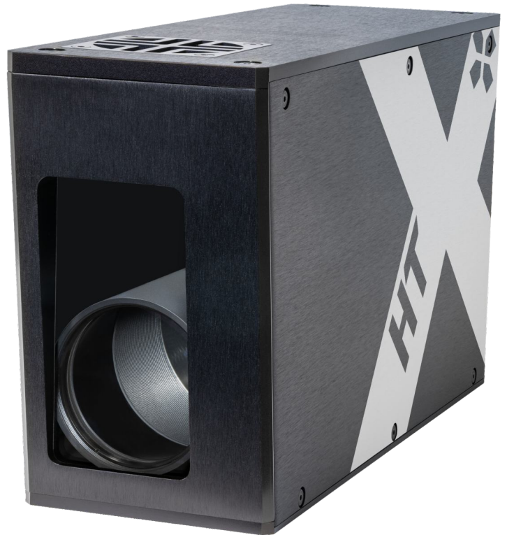
▲ X-Sight HT VE comes with a camera, lens, light, built-in USB relay, grid and calibration grid.

THE HT IS A PROFESSIONAL OPTICAL EXTENSOMETER OPTIMIZED FOR HIGH-TEMPERATURE APPLICATIONS, ACCURATELY FUNCTIONING IN ENVIRONMENTS FROM AMBIENT UP TO 1800°C.