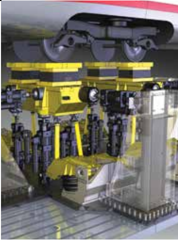
MTS Bogie Measurement Test System

How sophisticated bogie measurement is redefining expectations for innovative new designs