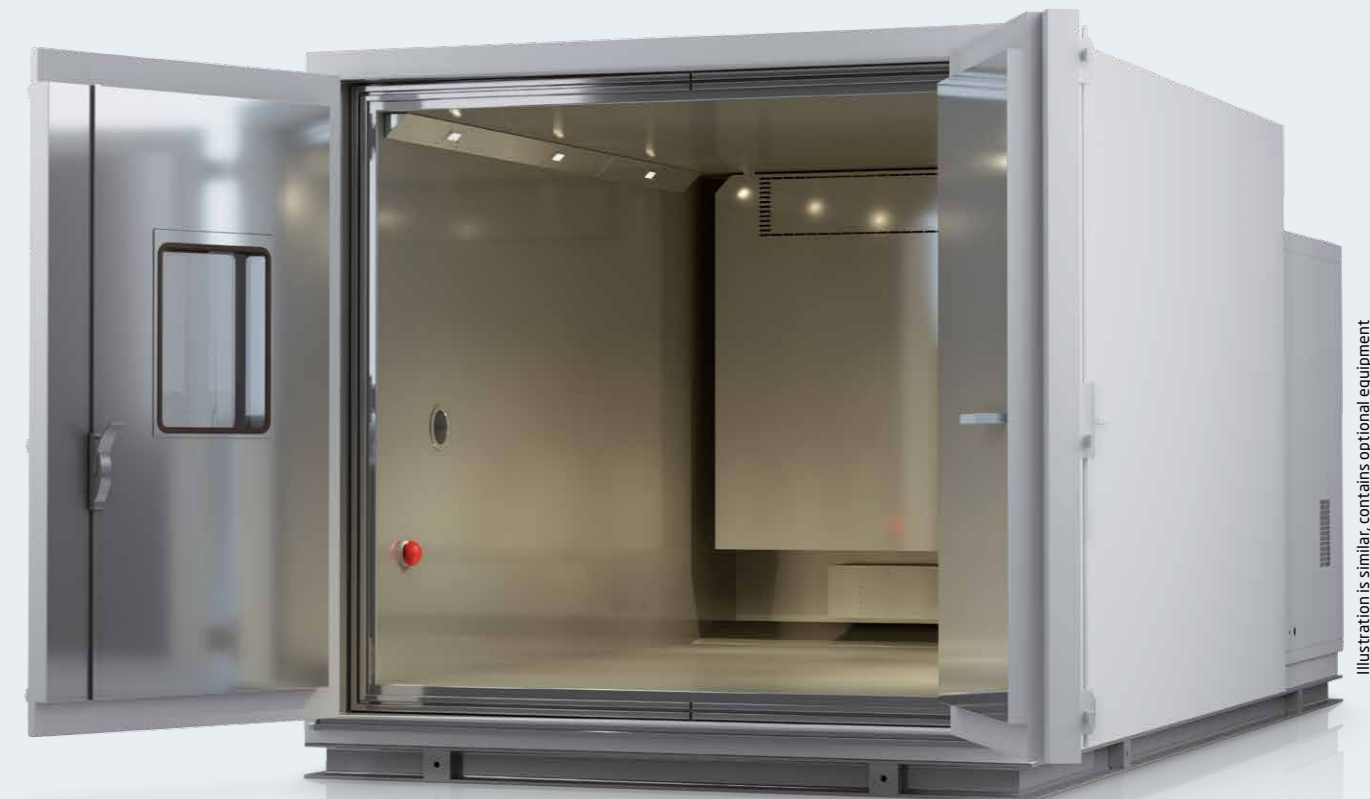
Illustration is similar, contains optional equipment

You can find further details on equipment in our technical descriptions. Contact us.