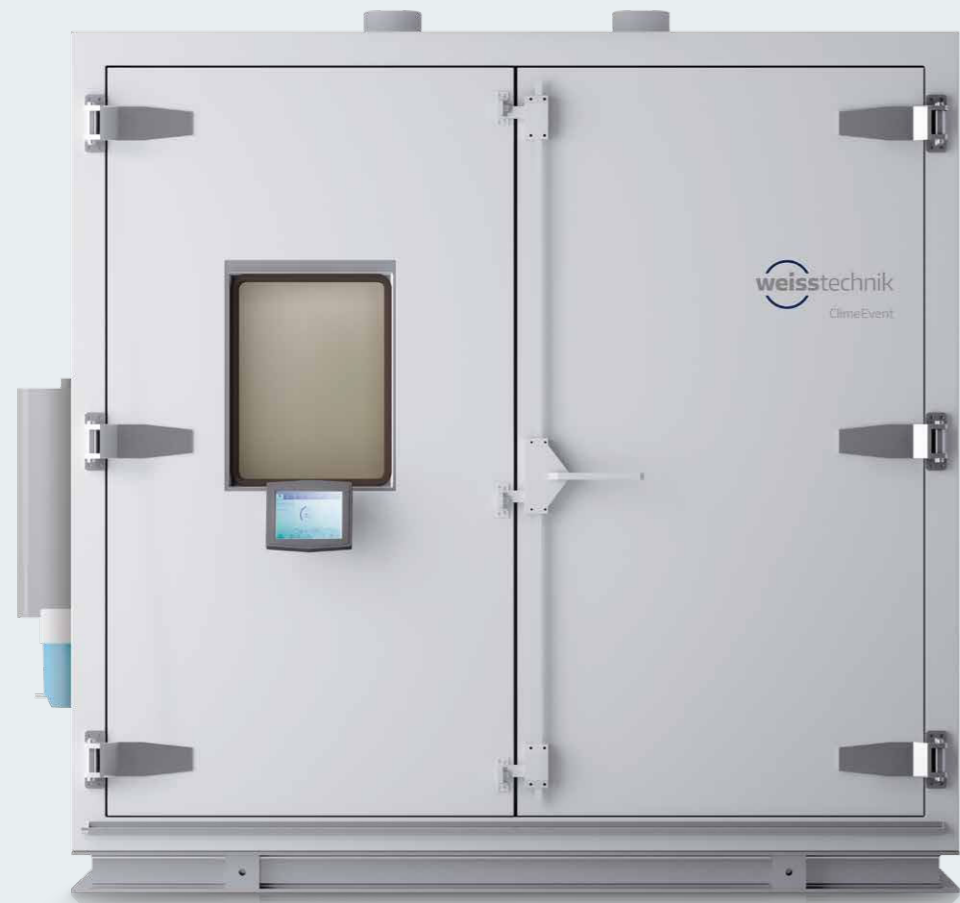
Illustration is similar, contains optional equipment

You can find further details on equipment in our technical descriptions. Contact us.