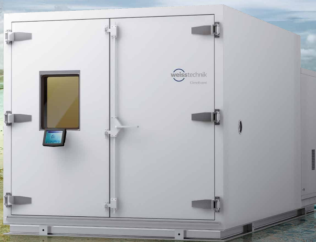
Illustration is similar, contains optional equipment